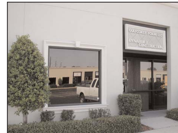
Suite entrance and custom signage

ORAL REPRESENTATIONS CANNOT BE RELIED UPON AS CORRECTLY STATING THE REPRESENTATIONS OF THE SELLER. THE SIZE AND LAYOUT OF SUITES AND BUILDINGS SHOWN HEREIN ARE ONLY APPROXIMATIONS. THE ACTUAL SIZE AND LAYOUT MAY VARY. THE SELLER NEITHER WARRANTS NOR GUARANTEES THE ACCURACY OF ANY OF THE FIGURES, MEASUREMENTS OR DEPICTIONS OF THE LAYOUT OF ANY OF THE BUILDINGS OR SUITES WITHIN ULMERTON BUSINESS CENTER. THE SELLER RESERVES THE RIGHT TO ALTER DESIGNS, VARY FEATURE POSITIONS OR SUBSTITUTE MATERIALS OF COMPARABLE VALUE AS DEEMED ADVISABLE OR NECESSARY BY SELLER